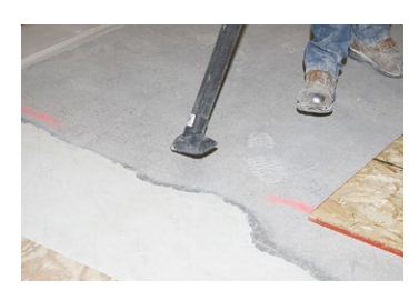
All areas of the renovation space are thoroughly vacuumed with a commercial unit. Removing all dust and debris from the subfloor enhances the bond of the materials to be used later in the project.