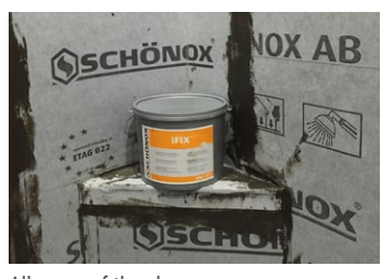
All areas of the shower spaces were covered with iFix<sup>™</sup> followed by AB, the sealing layer. AB is made of polyethylene for use with ceramic and natural stone coverings.