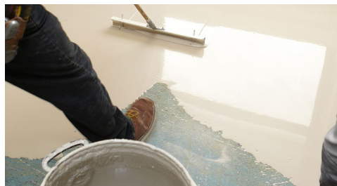
Schönnox AP, synthetic gypsum, self-leveling compound, can be walked on in approximately 2 hours and covered in approximately 24 hours.