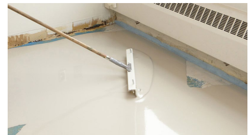
AP is extremely strong curing to 5800 psi.