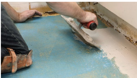
Schönnox AST, synthetic gypsum-based, rapid drying, smoothing and patching compound, provides a smooth finish on various substrates. It can be installed as a true featheredge over a variety of critical substrates.