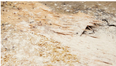
The plywood was loose in spots and separating in others.