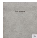
ST FC Sleeve 16.75" x 16.75"