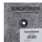
ST D8 Pipe Cover 4.73" x 4.73"w / 5/16" diameter hole