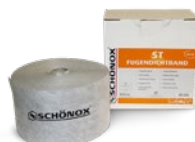
ST Sealing Tape