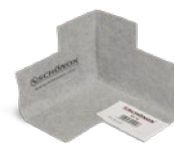
ST IC-Interior Corners