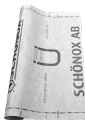
Sealing, Waterproofing Sheet Membrane