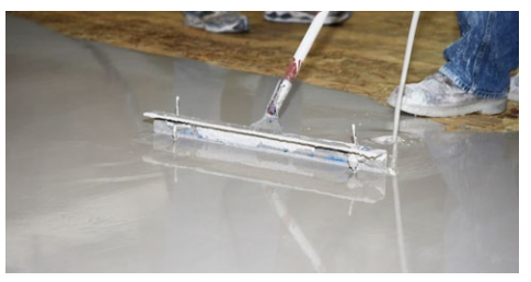
Schönox AP can be installed up to 2" and is ready for foot traffic after approximately 2 hours and covering after approximately 16 hours up to 1/8" layer thickness.