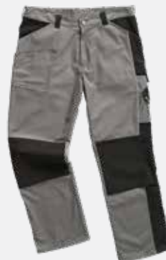
Coveralls Sizes: S, M, L, XL, XXL